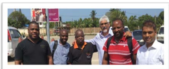
Members of the TWG with reps from PR and country coordinator